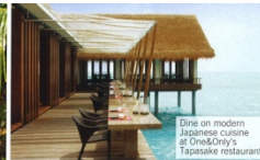
Dine on modern Japanese cuisine at One&Only's Japanese restaurant