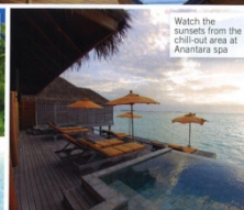
Watch the sunsets from the chill-out area at Anantara spa