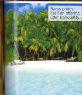
Baros prides itself on offering utter tranquillity