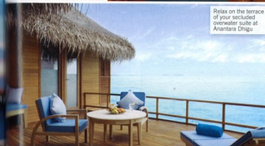
Relax on the terrace of your secluded overwater suite at Anantara Dhigu