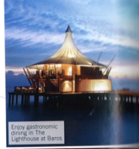
Enjoy gastronomic dining in The Lighthouse at Baros