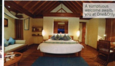
A sumptuous welcome awaits you at One&Only