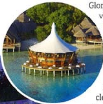
Something blue: it's impossible not to relax in the luxurious resort – no longer just a honeymoon haven