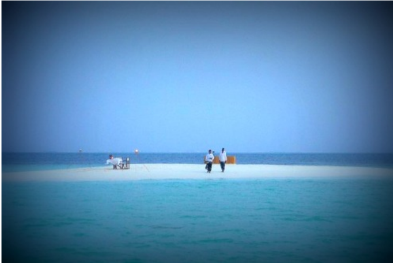
A romantic Sandbank Dinner being set up a stone's throw from Baros Maldives.